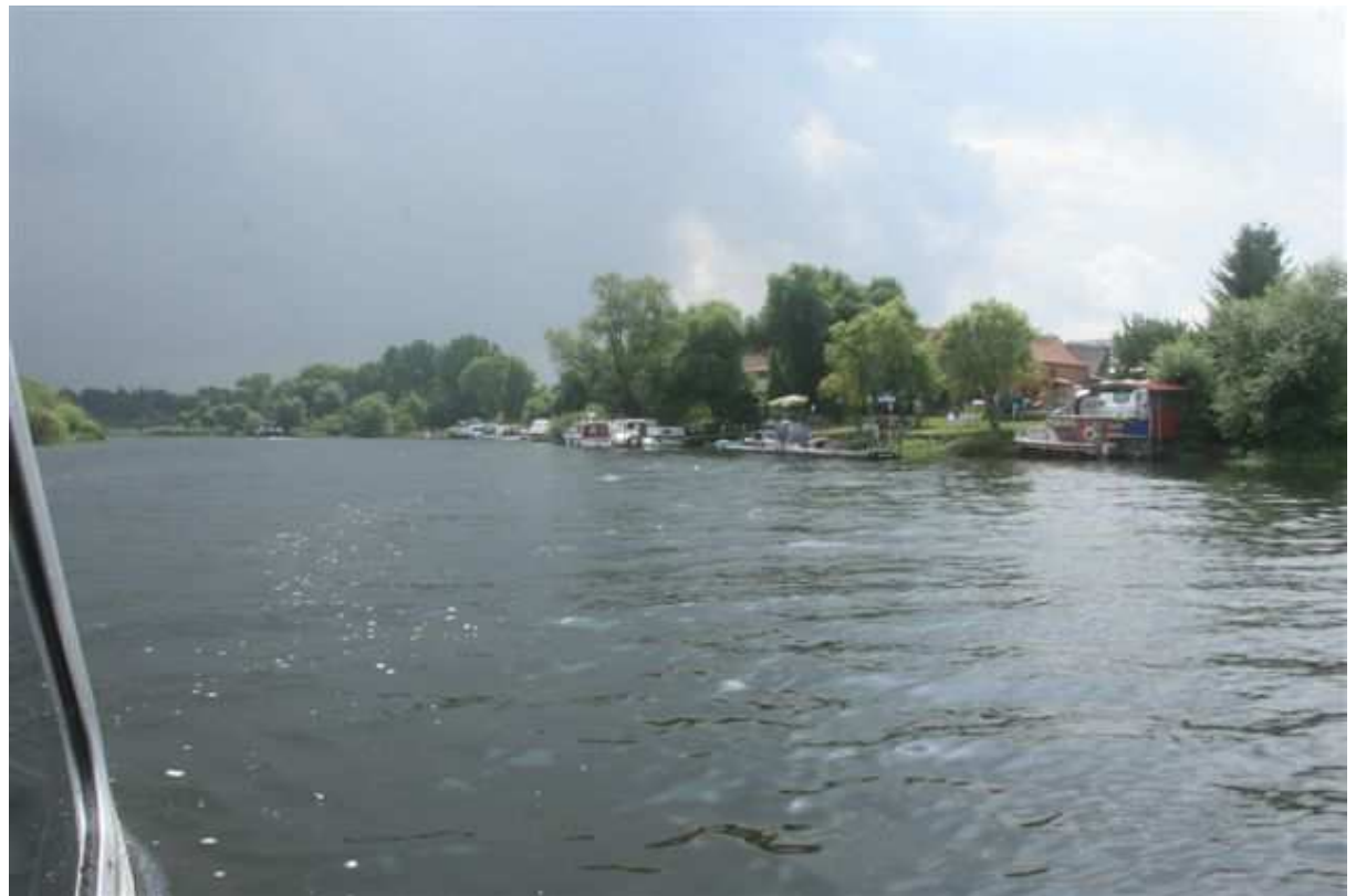
Now and then a glimpse of civilisation.

At noon we pass the city of "Rathenow" with it's 2 locks and continue direction Brandenburg.