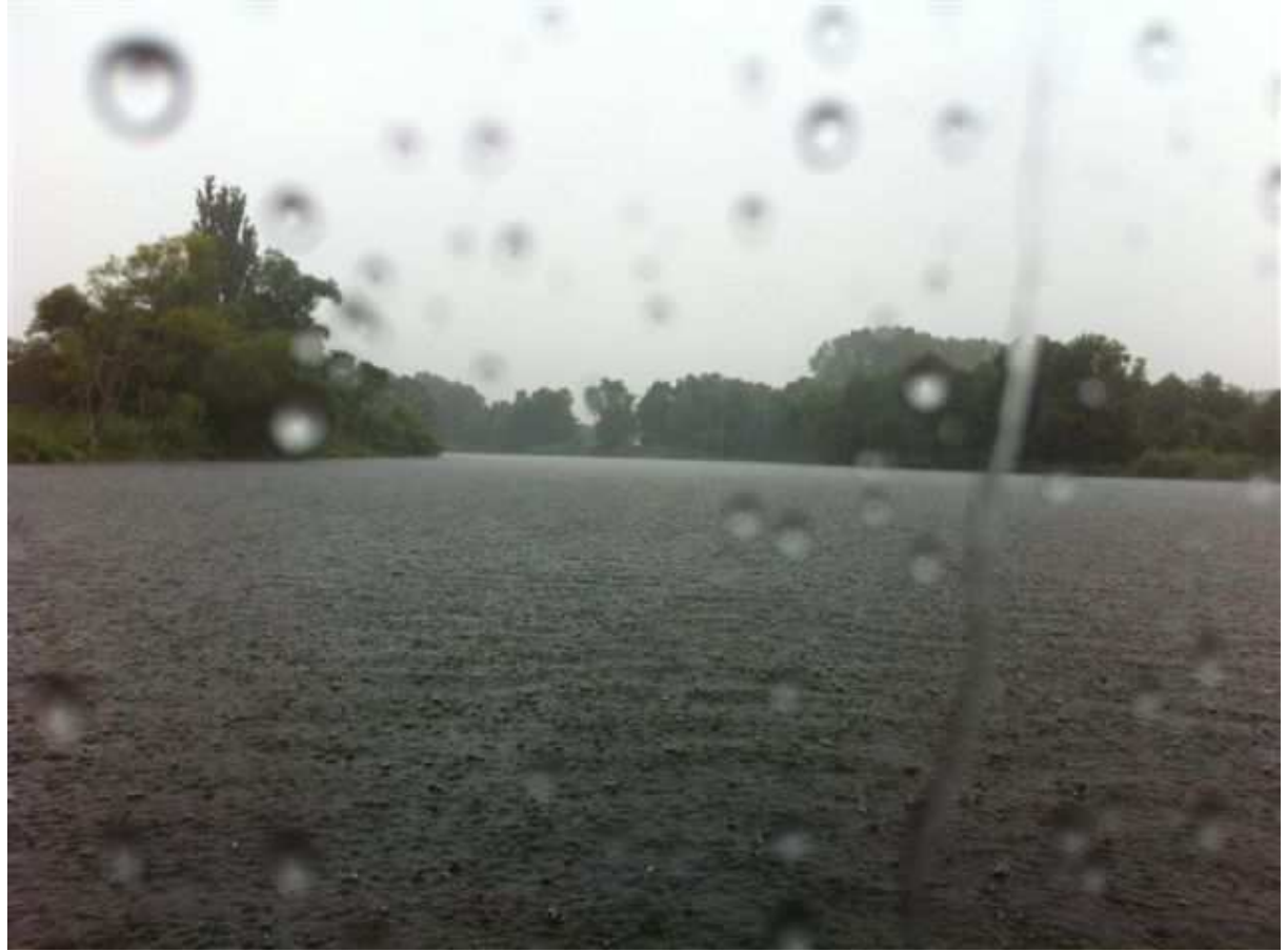
A heavy, almost tropical rain shower on the river Havel.

As soon as the impressive, but short rain shower has passed, the sky clears up again and the beautiful colours come out.