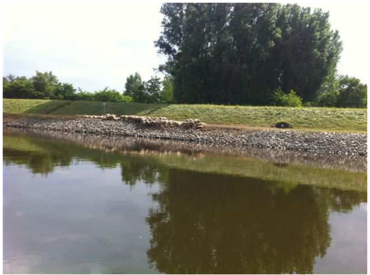
Sheep grassing on the banks of the waiting area before the Havelberg Lock.