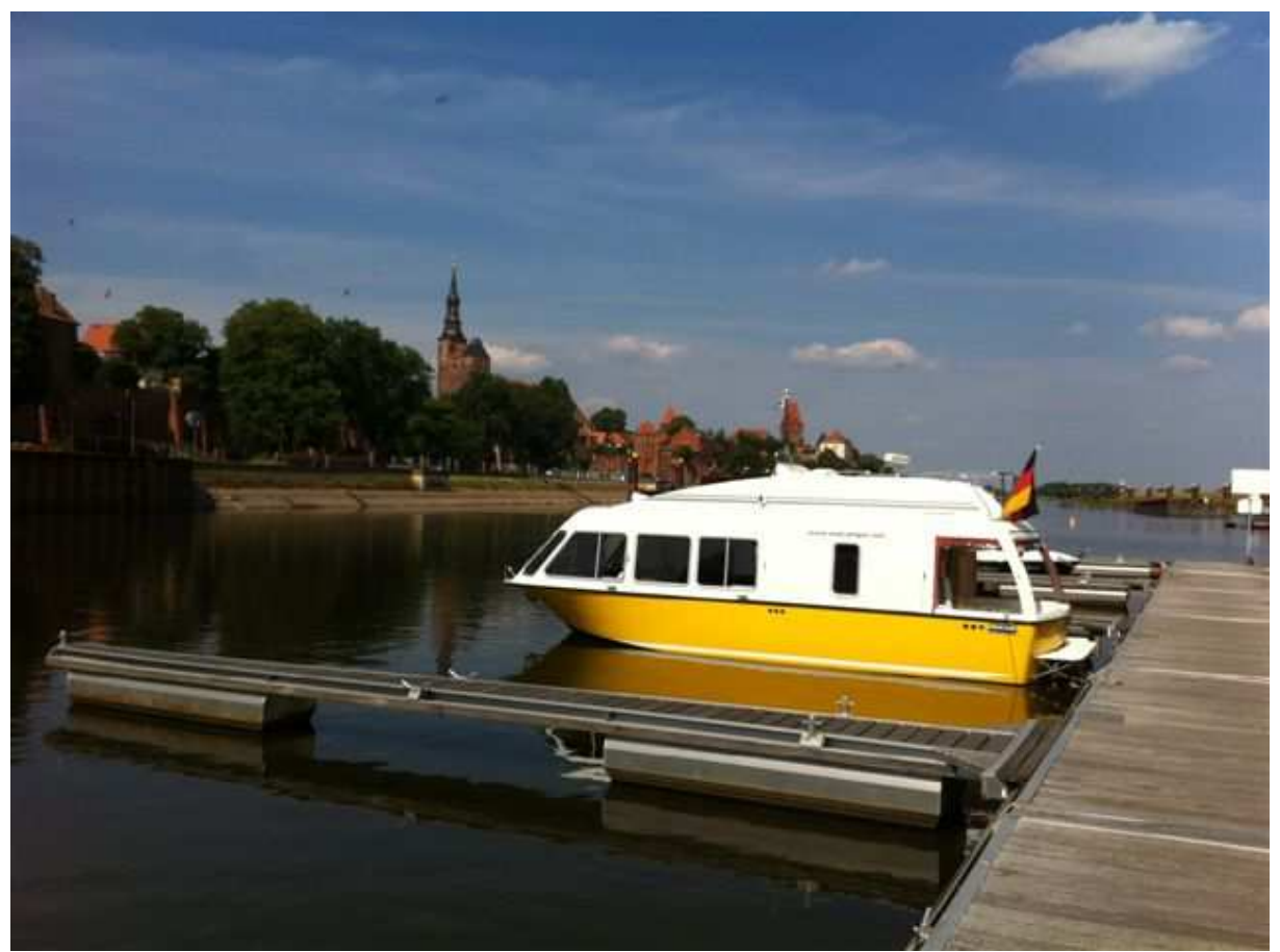
Tangermünde has a small, but well equipped marina with good facilities.