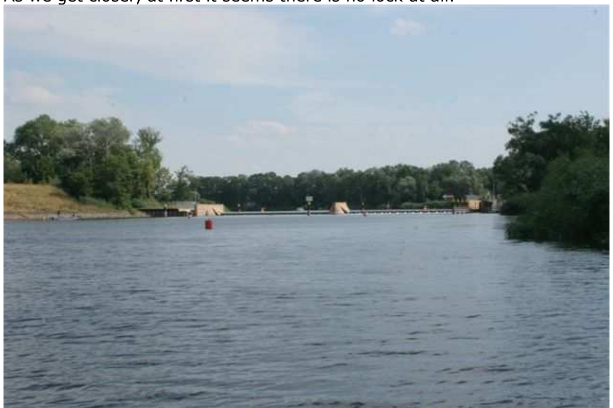
The weir at Bahnitz.

Some 10 kilometers north west of Brandenburg we approach the Kahn Schleuse at "Bahnitz", a lock for smaller boats. Our chart informs us, that the lock is 2,4 m wide - the Seacamper 810 is 2,5m, but even so, we decide to take a look at it. Just for the fun of it! As we get closer, at first it seems there is no lock at all.