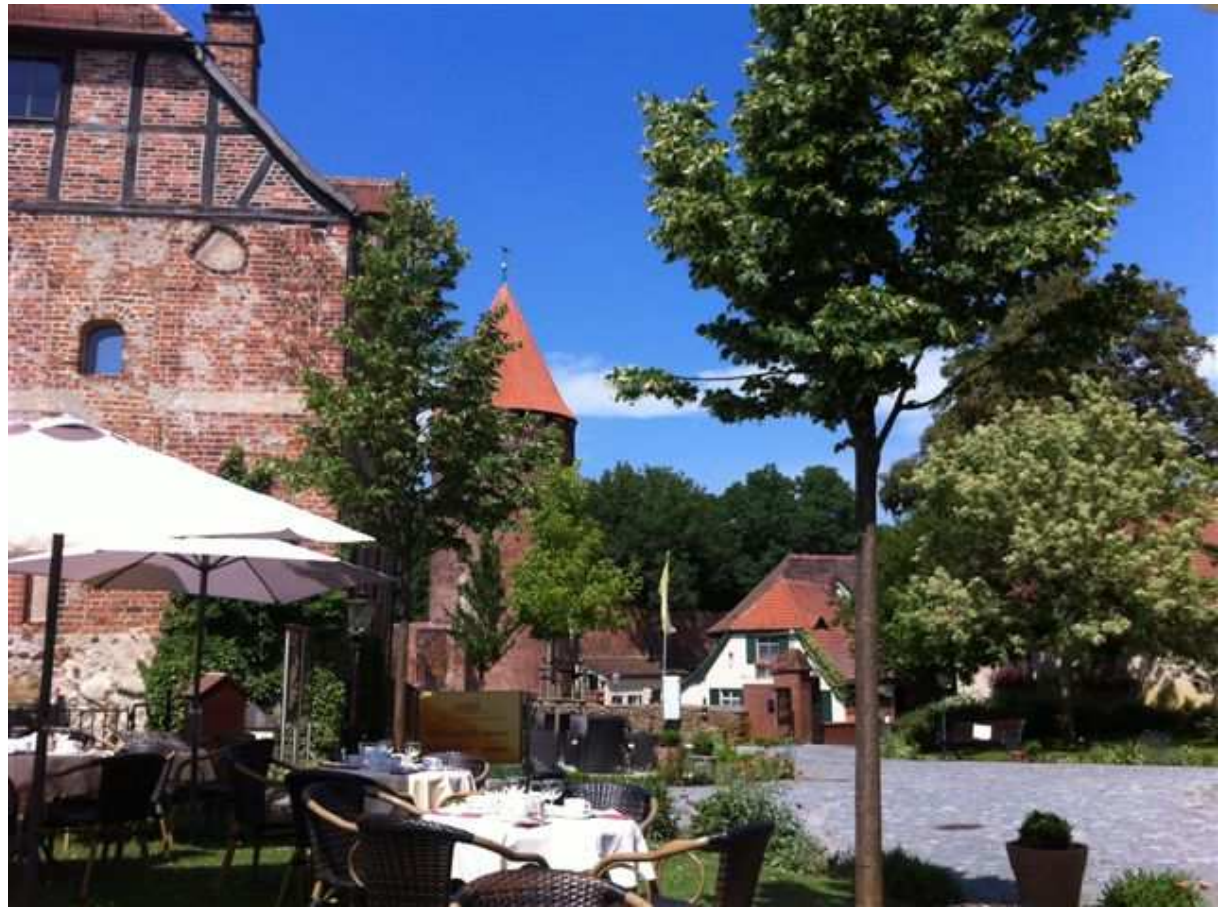
A fine restaurant has been established inside the ramparts-