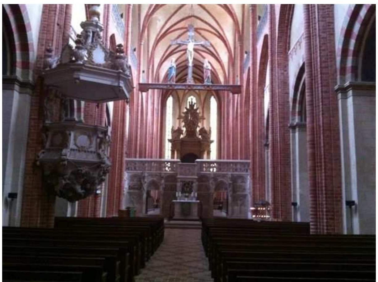
Middle-age cathedral of "Havelberg"