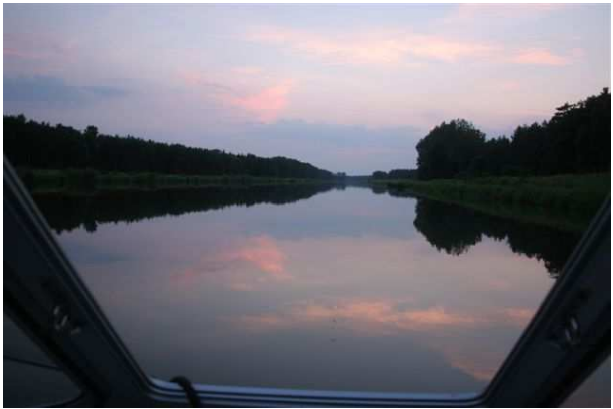
Summer evening over the "Elbe-Havel-Kanal".

At 1800 hrs we were ready to go and set of down stream along the river "Havel" crossing the "Wendsee", where we stopped for a soothing swim in the warm (25°C) and clear water. At 2100 hrs the sun was still up and we were already several kilometres into the "Elbe-Havel-Kanal" towards the west and the river "Elbe". It was the plan to find a quite place somewhere in the lovely pine-woods which surround a larger part of the channel.