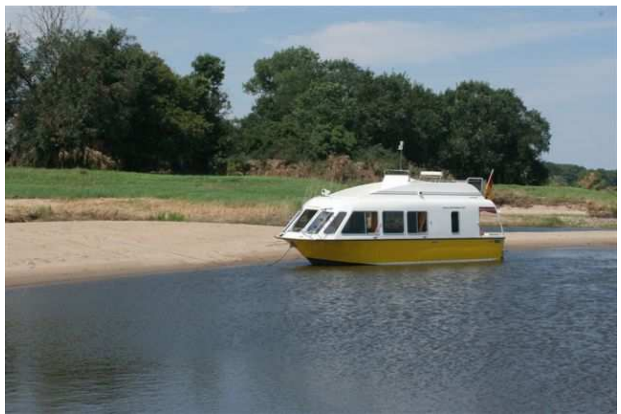
The Seacamper 810 is the ideal explorer for a journey like this.

Later in the afternoon, we haul in the anchor and sail on down river, heading for the old "Hansestadt" Havelberg.