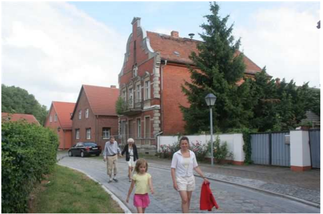
The crew in Garz.

Once an important fishing harbour, Garz today seems to be populated only by some 50 people who live mainly of tourism visiting the nice and cosy pension installed in a former farm house.