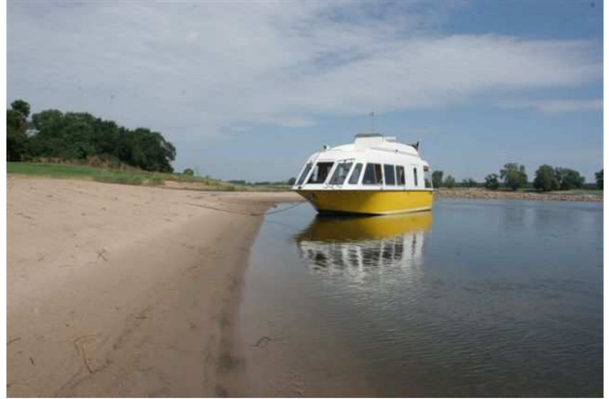
Lunchbreak in the sand.

The weather is hot summer weather and it is a relief to get a swim and cool off in the river.