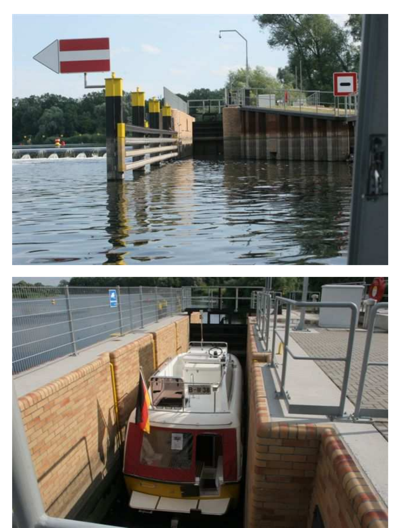
Voila! - we fit in. Who should have thought that?! This must be the smallest lock I have ever passed through.