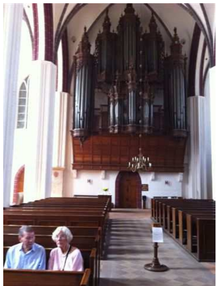
"Scherer-Orgel" in the cathedral of Tangermünde.