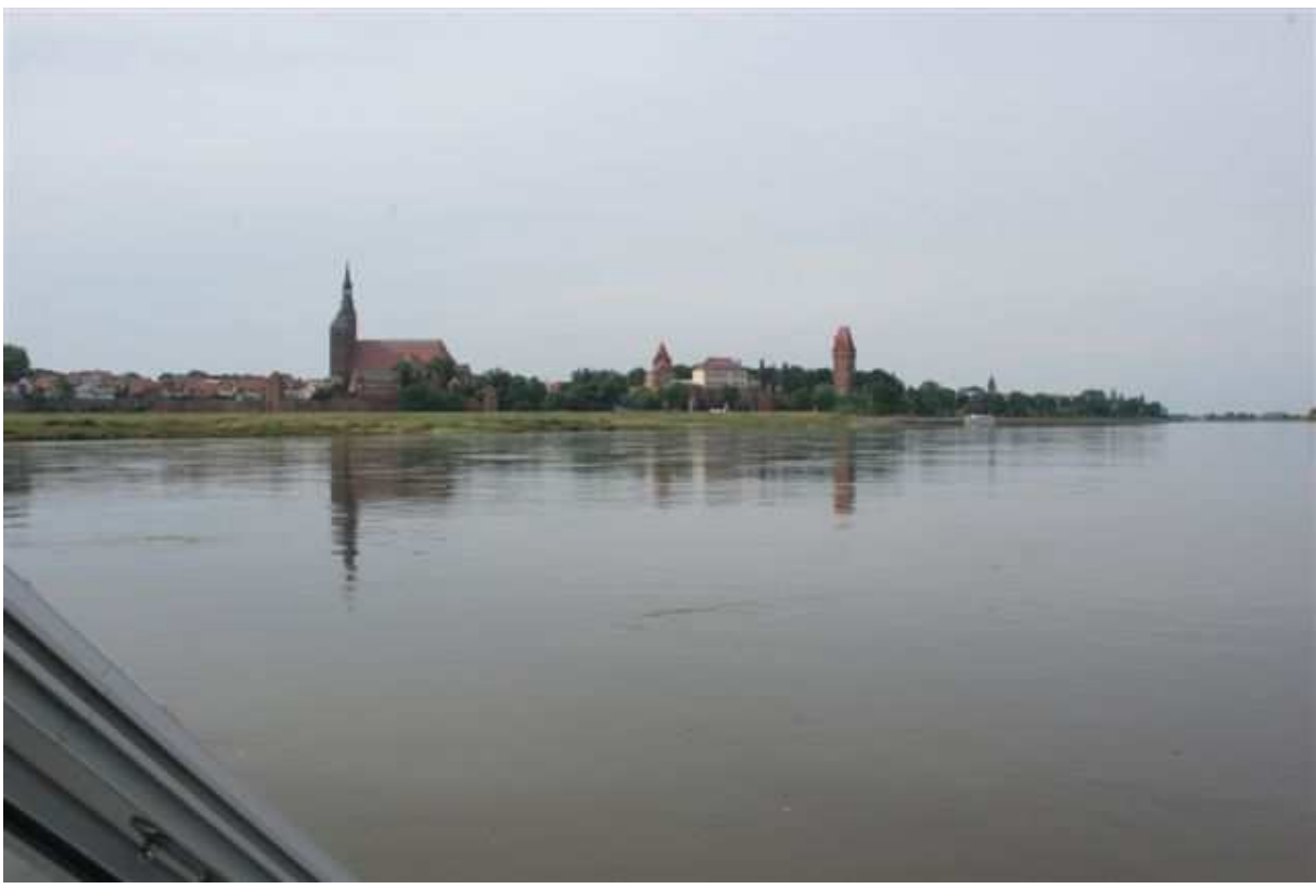
Approaching the city of "Tangermünde"

After a couple of hour's easy and calm drive down the Elbe, we reach the old middle age city of Tangermünde. In those days, a city of residence of the Emperor of the "Holy Roman Empire of the German Nation", and one of the few German towns that survived the 2nd World war. That makes the place very special and charming. The big cathedral is kept in good shape and treasure one of the most valuable early-baroque organs in Europe. You can listen to it every afternoon.