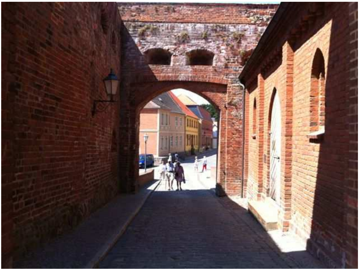
The entrance to the old castle.