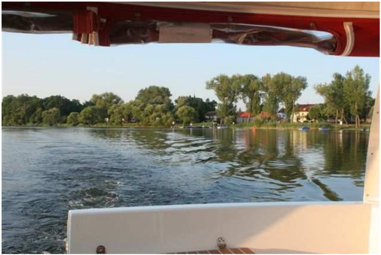
Briest in the warm evening light

On the other side of the lock, the water way widens and an occasional farm building show up. Slowly more buildings, and even small towns join and we realise that we are getting closer to the City of Brandenburg.