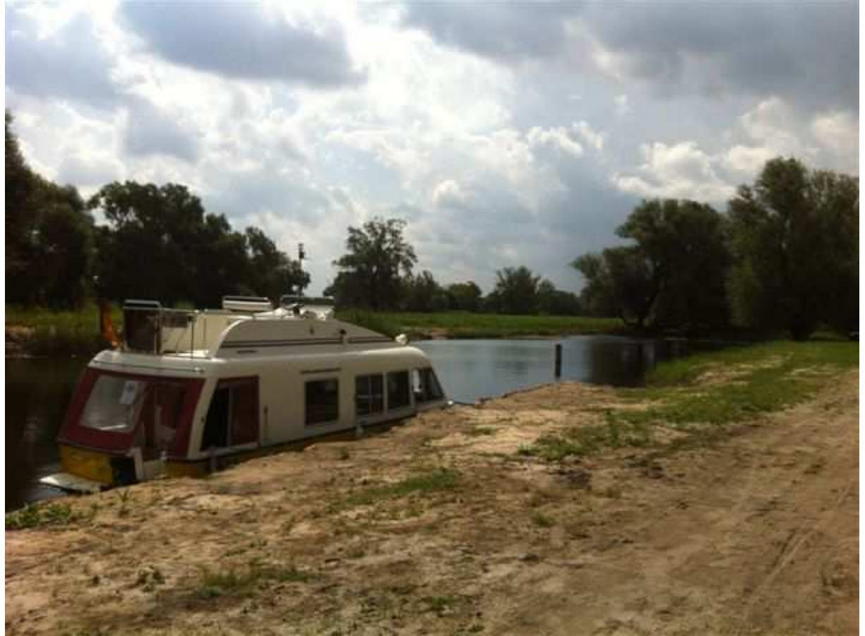
Stopover in Molkenberg.

But we have everything we need with us onboard. Large comfortable saloon, Comfortable beds, big bath room with separate shower, ample provisions and a "kitchen" where the cook manages to prepare a delicious dinner this evening.