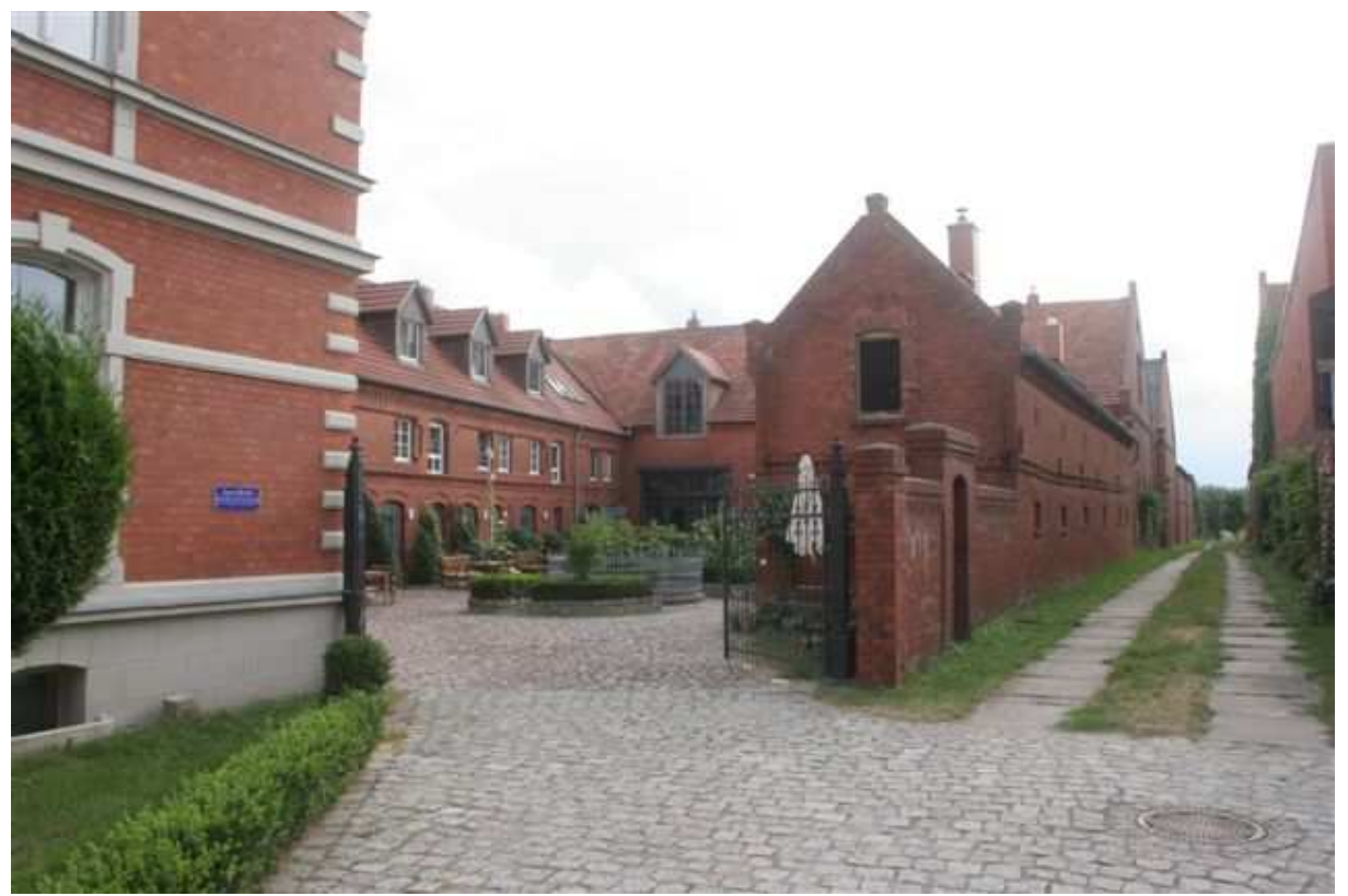
The pension in Garz, installed in a thoroughfully renovated Farm house.