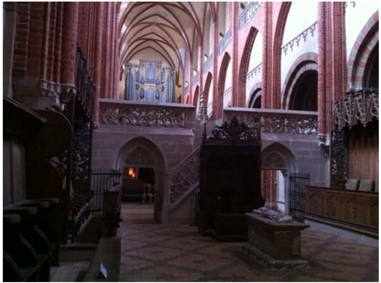
The impressive Havelberger Dom St. Marien from AD.1170

Also here, you will find a large, old and well preserved Organ from 1777.