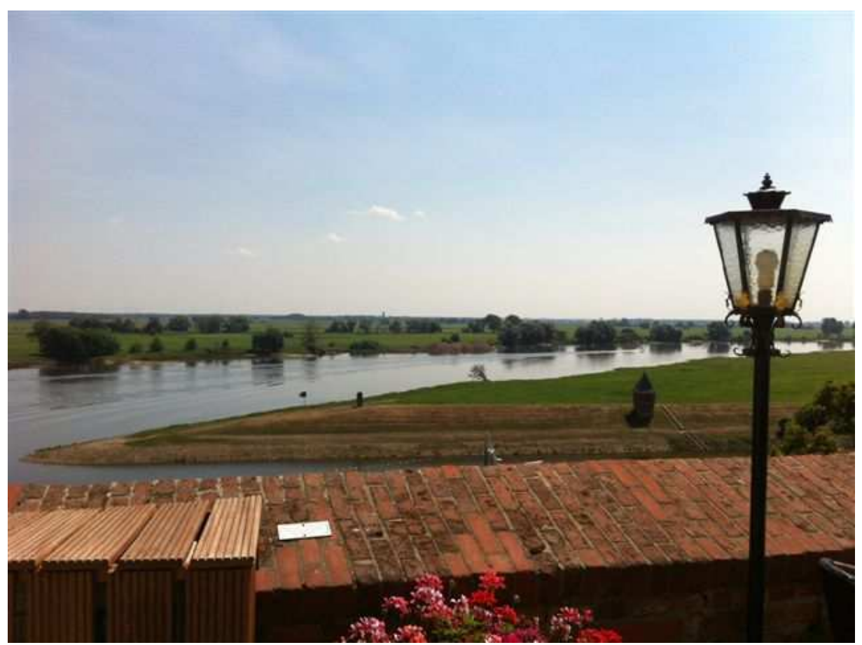
- and from here, you have a fabulous view over the Elbe-landscape.