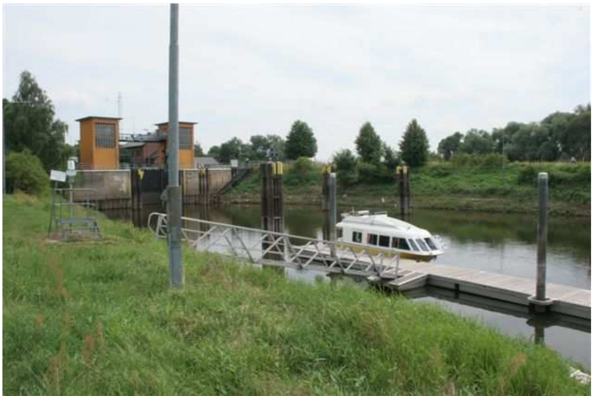
Lunch break just after the lock at Elbe-Parey.